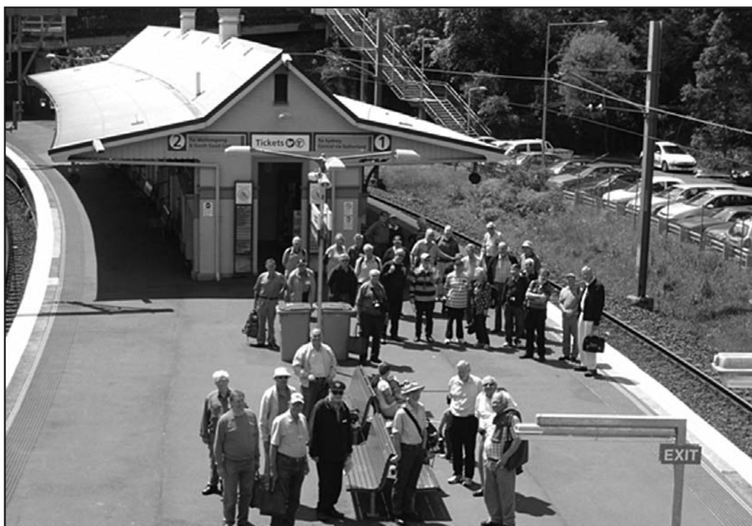
The current Helensburgh Station. The curved platform and building are evident.