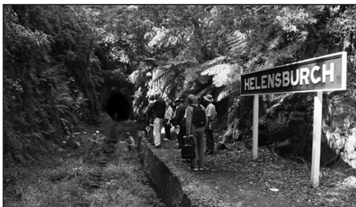
The 1889 Helensburgh Station, minus the building which was demolished long ago. The entrance to No.4 tunnel is in the background.