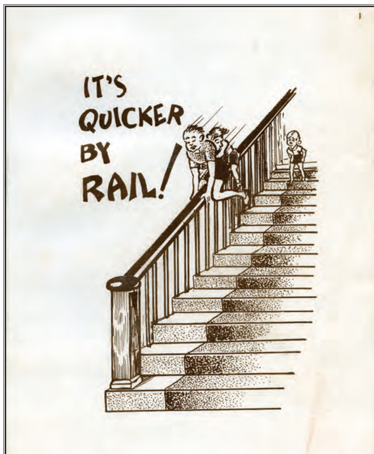
Cyril Cauldwell drawing (former NSWGR graphics artist). ARHS RRC Image No. 306407B