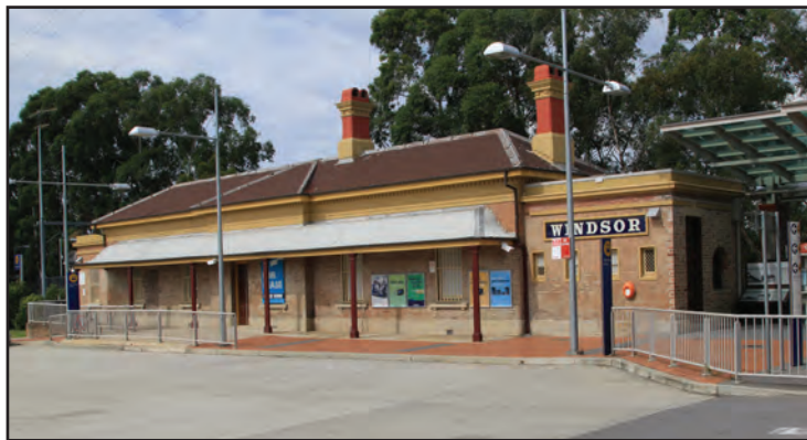
Upper: The 1883-built station at Windsor from the car park side. Lower: The former Windsor goods yard crane has been repositioned.