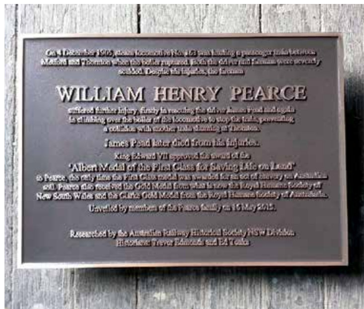
The brass plaque, funded by ARHSnsw.