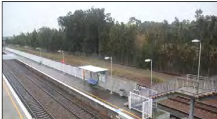
Below: The same scene today.