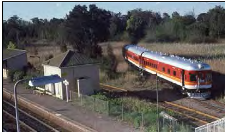
Upper: On 22 September 1985, 669 trails a 2-car set onto the Sandgate Cemetery branch at Sandgate.