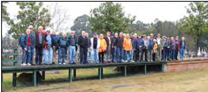
Our group on the disused Sandgate Cemetery platform.